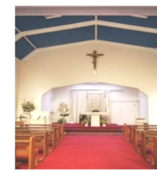
St Michael's Catholic Church The Parish Office/Hall Silver Street Tetbury GL8 8DH