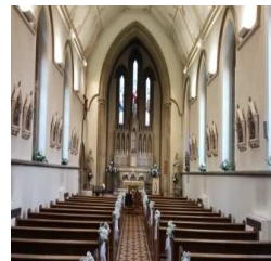
St Peter's Catholic Church 7 St Peter's Road Cirencester Gloucestershire GL7 1RE