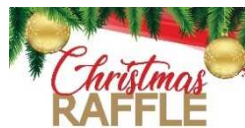
TABLE TOP SALE AND RAFFLE St Michael's is holding a pair of Table Top Sale on Sundays 5 th & 12 th December after Mass. Donations of New Items should be left in the porch. Tickets for our RAFFLE go on sale this week. The Draw will be on Sunday

19 th December with coffee and mince pies in the hall. Prizes are always welcome The money raised will go towards upgrading the church garden and the Wiltshire Air Ambulance which has attended incidents in Wiltshire, Somerset, Gloucestershire (including Tetbury and Cirencester and Oxfordshire)..Thank you for supporting us in our endeavors as we try to come together as a Parish Socially after what has been a difficult year for all of us.