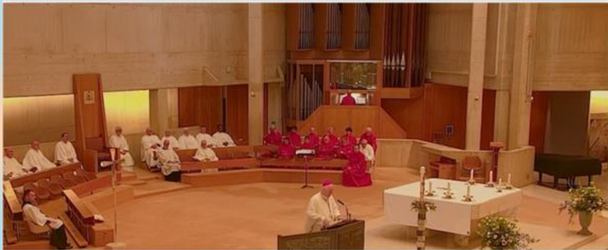
Bishop Bosco MacDonal Mass for Pope Francis 21 st April 2025

View the Homily: Bishop Bosco's Homily for Pope Francis | Clifton Diocese